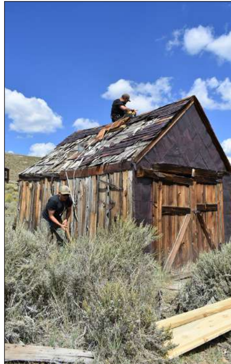
Park employees stabilize a Bodie building in 2019.

I'm pleased to announce now that State Parks has contracted with Garavaglia Architecture, Inc. and Linchpin Structural Engineering to collaborate with State Parks staff (including on-the-ground maintenance staff in Bodie) and the Foundation to launch this Long-Term Stabilization Plan (LTSP). Garavaglia Architecture, Inc., a San Francisco based firm, are Bodie veterans, having successfully collaborated with the Foundation and State Parks on the stabilization of the Railroad Office. And Linchpin Structural Engineering, based in