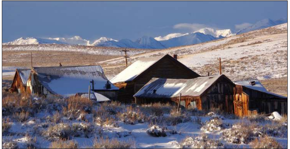
A Long-Term Stabilization Plan launching this summer will aid in planning stabilization for Bodie's buildings