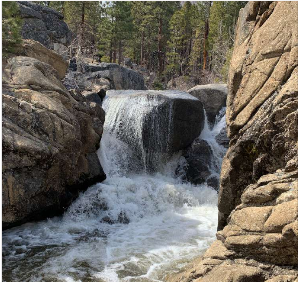
Beautiful scenery awaits those hiking trails at Grover Hot Springs State Park.

Our summer campground is now on a reservation system starting May 10. Reservations can be made 48 hours to six months in advance by going to ReserveCalifornia.com or by calling 1-800- 444-7275. We