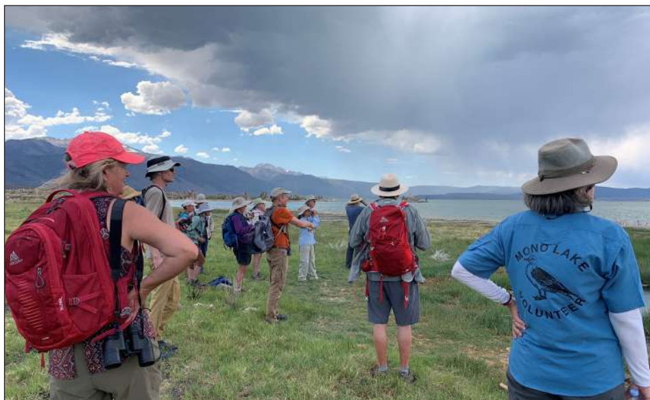
Dedicated Mono Lake Volunteers helped with tours and answering questions from visitors during 2021.

In early September, we saw the closure of the Inyo National Forest due to fire danger and decreased staff and resources. The State Parks sites around Mono Lake remained open to visitors which naturally led to increased visitation at sites such as Old Marina, with visitors desiring access to the lakeshore since the main visitor site of South Tufa was closed. The closure lasted for just over two