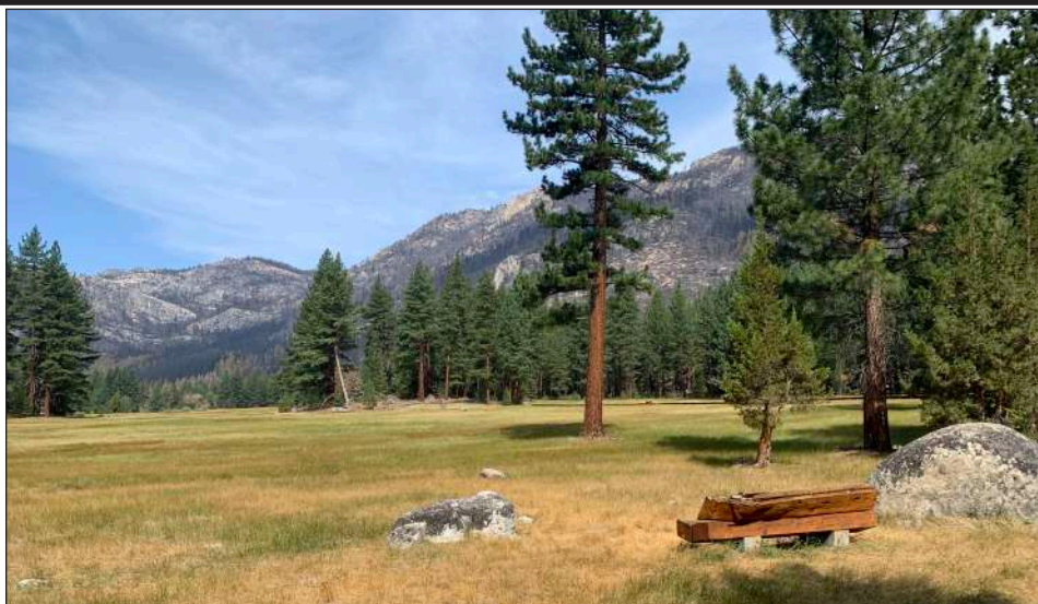
The view from the "sunset bench" looking west across the meadow is nearly unchanged, except for burned mountain slopes in the background.

Although the fire is over, much work remains. Because of the loss of the shop and residences, and because