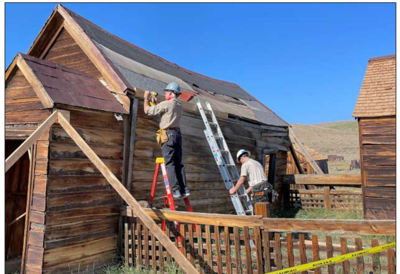
At left, the "after" photo of the Standard Mine change room. At right, another team of HistoriCorps volunteers work on the D.V. Cain Barn. HistoriCorps crews worked at Bodie for three weeks in September.