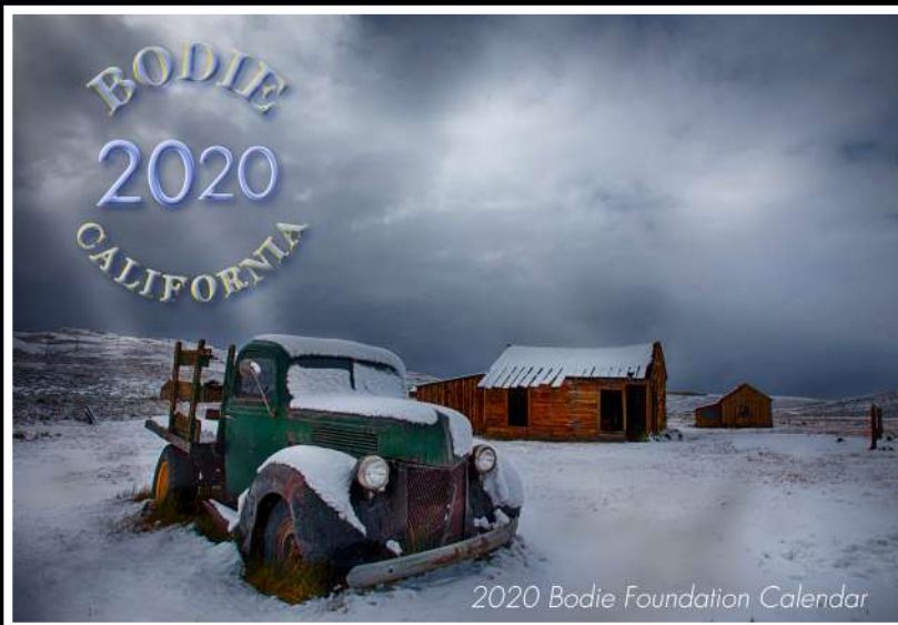
2020 Bodie Foundation Calendar