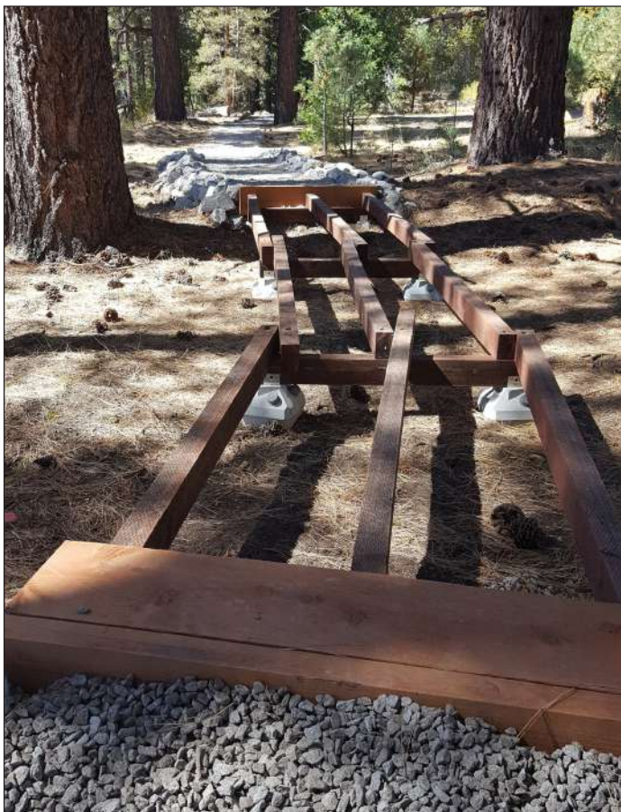
Bridge crossings will protect wet parts of the new trail.

trail will be constructed of packed soil over crushed rock. Interpretive panels will eventually be placed along the trail as well as resting and viewing platforms.