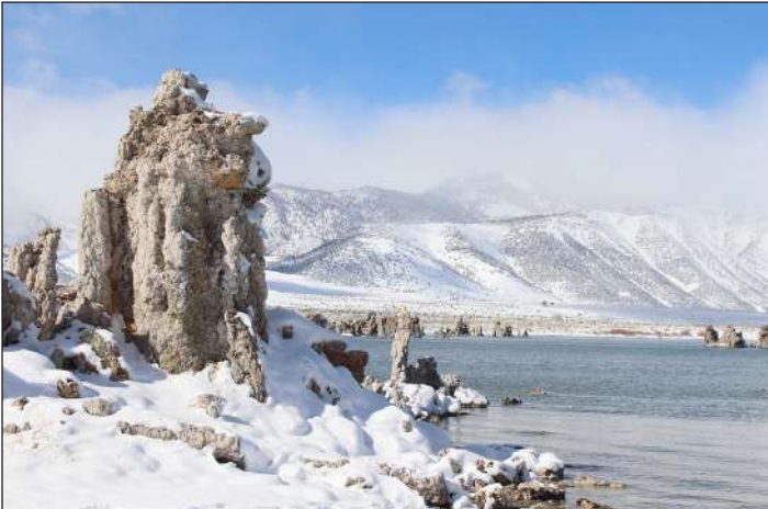
A beautiful snowy scene at Mono Lake this past winter. The big snow year is good news for the lake.