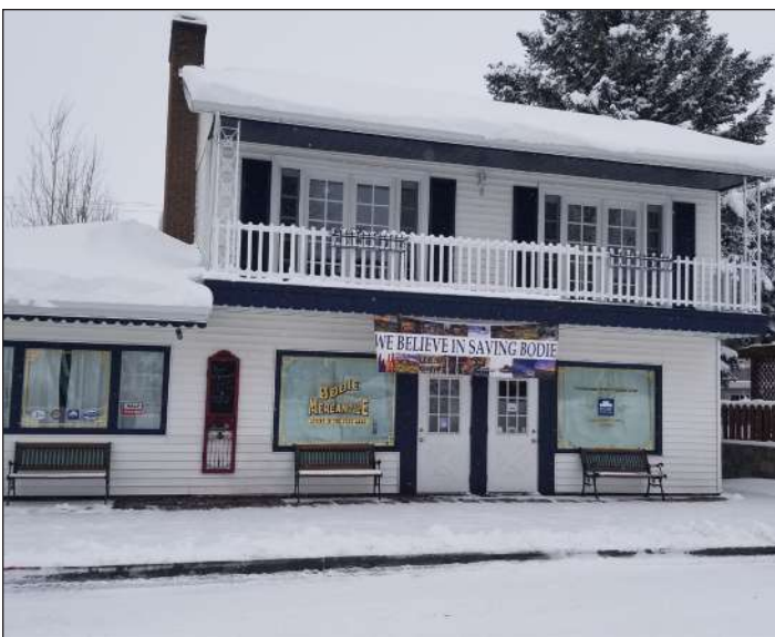
A light blanket of snow covers the Bodie Mercantile in Bridgeport after a winter storm this year. Business hours are Thursday through Sunday, 9 a.m. to 4 p.m. Hours may vary, so call us first, 760-932-7574.

Not able to make it in? Check us out at http://www.bodiefoundation.org/store/ . Follow us on Facebook at Bodie Mercantile to find out about new inventory and any specials we are offering.