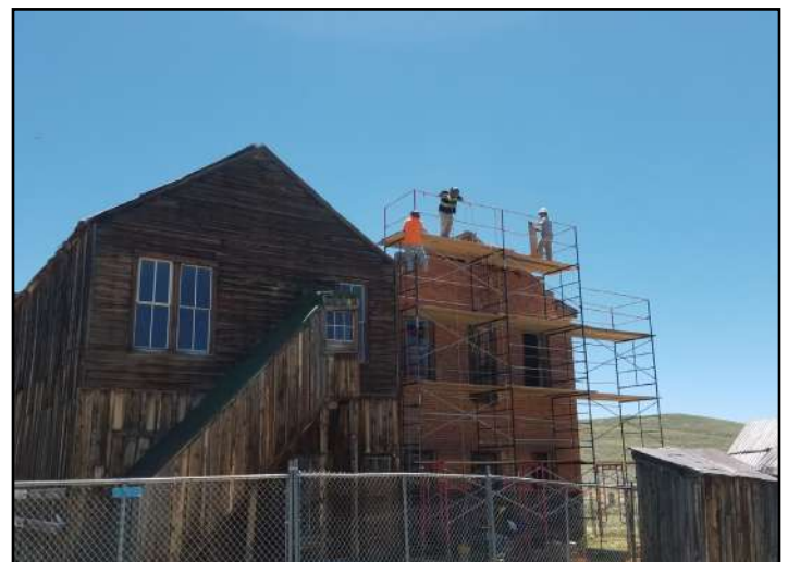
The DeChambeau building spent the summer enclosed in a fenced work area to repair damage from the December 2016 earthquake.