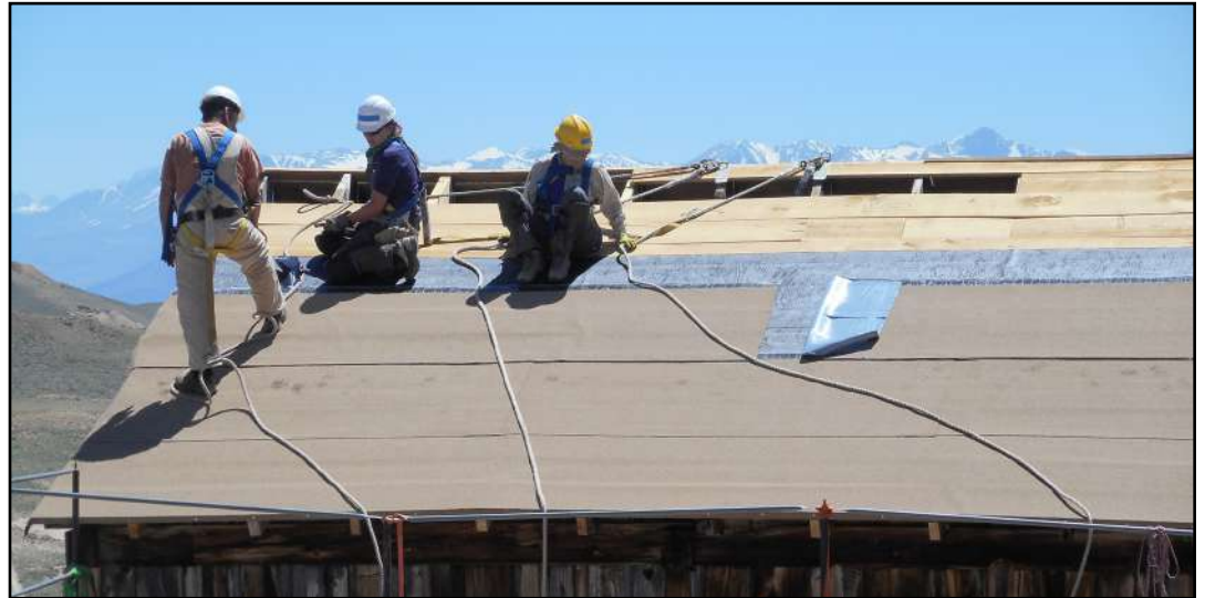
A trio of HistoriCorps volunteers at work on top of the Standard hoist building had a view of the Sierra Nevada during roof repair this summer.