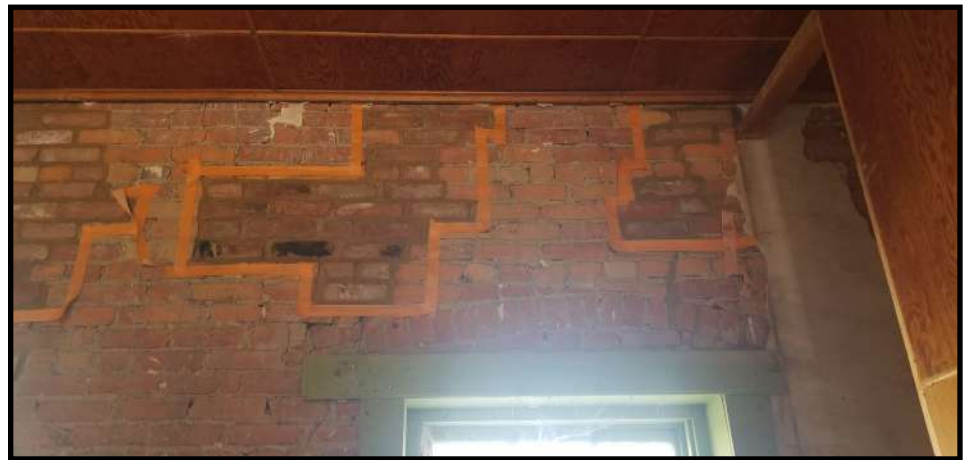
Inside the buildings, the workers repointed (re-mortared) the bricks that had fallen out.

There was also extensive repair of back wall facade to bring the building