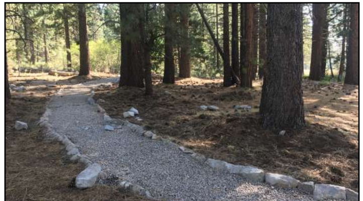
Crews started work on the new accessible interpretive trail around the meadow this summer.