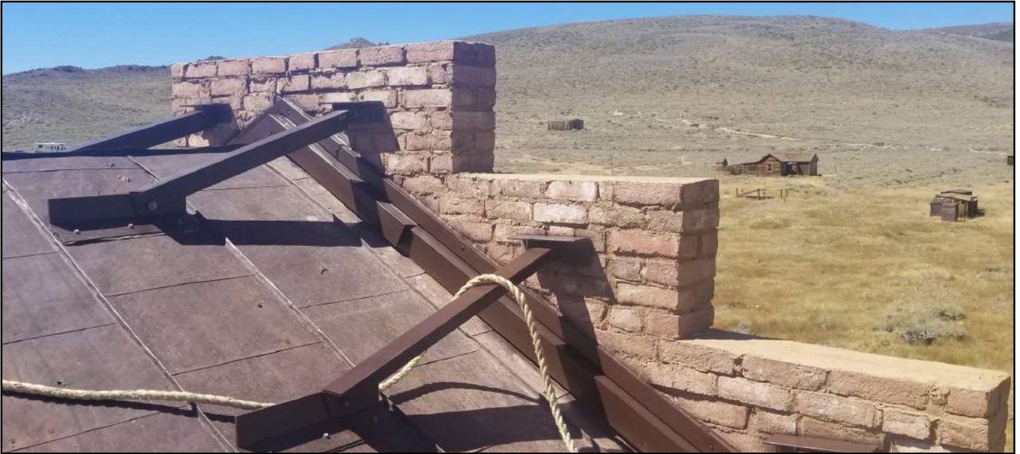
Workers braced the back roof to secure the damaged back wall.