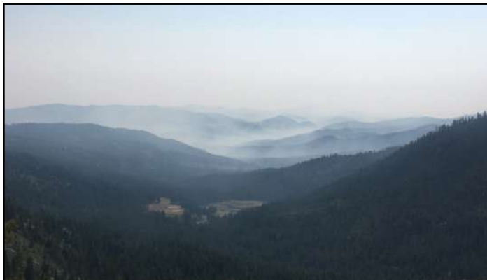
Smoke from the Ferguson and Donnell Fires impacted air quality in and around the park for several weeks.