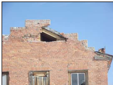
Powerful earthquakes in December 2016 shook open a hole on the west side of the DeChambeau Hotel.

On December 28, 2016, a series of earthquakes shook the area approximately 14 miles from Bodie. Those quakes, registering 5.7, 5.7, and 5.5 magnitude on the Richter Scale caused considerable damage. The park