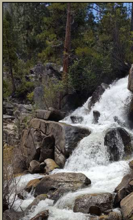
This winter's snowfall resulted in two beautiful winter and spring views of the Hot Springs Creek waterfalls, usually referred to at Grover Falls.