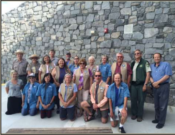
The 2016 graduating class of Mono Lake Volunteers.

Train to be a volunteer at Mono Lake this summer and share your knowledge of the Eastern Sierra with visitors from all over the world!