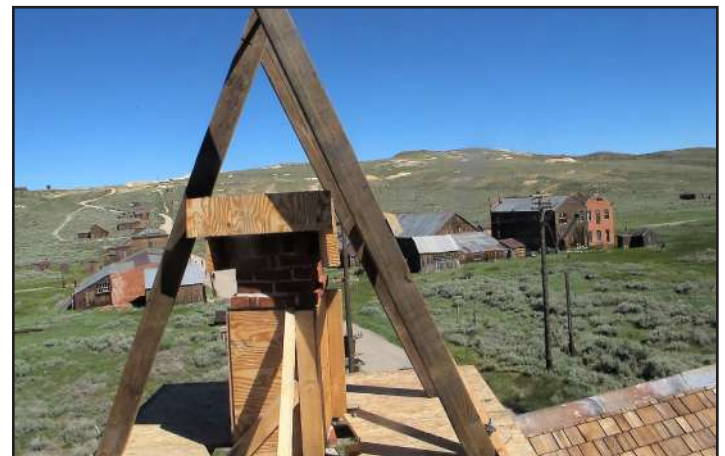
To repair the J.S. Cain house chimney, workers built a platform and clamped the chimney down with compression straps. They then put on an A-frame, lifted the chimney a couple of inches and put it back square.