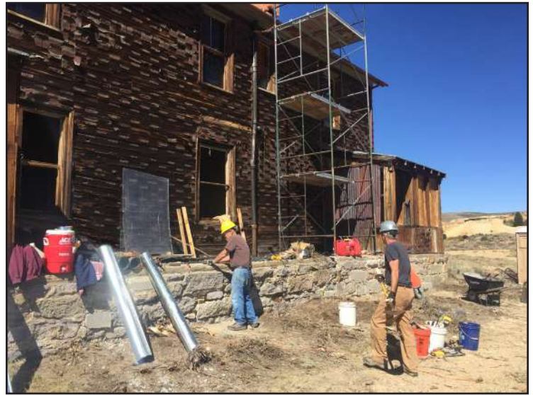
A crew from HistoriCorps, a nonprofit organization that provides skilled volunteers to preserve historic structures on public lands, works at the Bodie Railroad Office in September.

goal, and exceeded it, in a very short period of time. Since then, a new roof was completed, and a soil survey had to be done in order to work on the foundation. New window frames were in a shipping crate awaiting installation. All we needed was a crew to do the work on the foundation.