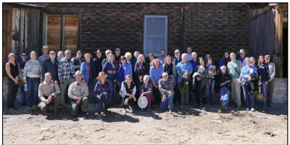
Sierra District Cooperating Association members and State Park personnel pose for a photo at the Railroad Office in Bodie during their 3rd Annual Meeting with State Park partners Sept. 29-30.

We are “Protecting Bodie’s Future By Preserving Its Past.”