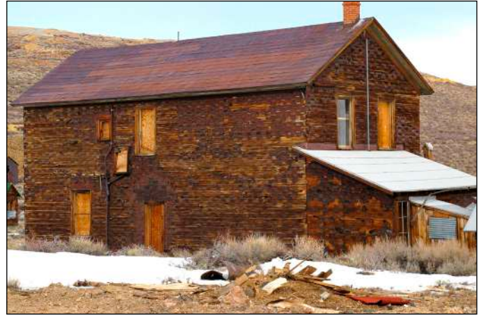
The rusted roof of the train depot office building (near water tower) is one of six arrested decay projects being funded by the Bodie Foundation. Bodie's original structures are under constant attack from the area's harsh climate. The goal is to keep the structures as they were when Bodie became a State Park in 1962.

When you're in Bodie this summer, look for our banners on buildings that are undergoing this important task – these are your funds at work to arrest that dreaded decay.