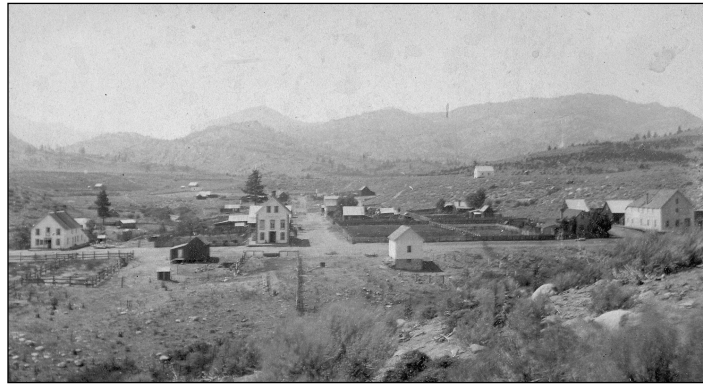
Markleeville circa 1880 after clear cutting. Wood products from this valley were used in mining towns like Virginia City and Aurora during the 1860's and 1870's.

Visitors following the trail of John C. Fremont, the first white man to visit this spot in 1843, were overcome by the natural beauty of the area. In 1863, a visitor reported to a Sacramento newspaper, "About three miles from Markleeville is a most beautiful valley called