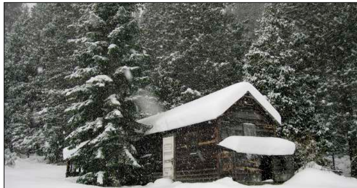
A cabin sits on the site of Alvin Grover's Hot Springs Hotel, which burned down in 1919. The structure was later used as a summer cabin for a ranch family and is now used as occasional living quarters for park personnel.