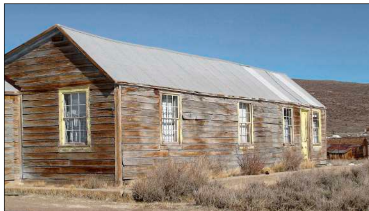
The Moyle house (used as an employee residence) will have its roof repaired and the swayback Bell garage (top) will receive stabilization work and partial roof repair this year.