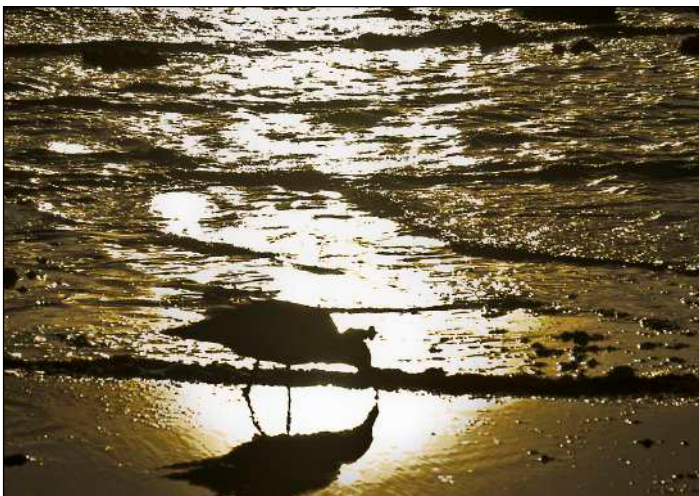
A California gull makes an evening meal of alkali flies at Mono Lake's shoreline.

The next time you pass by Mono Lake on your way to Bodie, know that at least for the near future, the Bodie Foundation will be fulfilling its mission to keep the Mono Lake Tufa State Natural Reserve funded and protected for the 250,000 visitors who stop at Mono Lake each year.