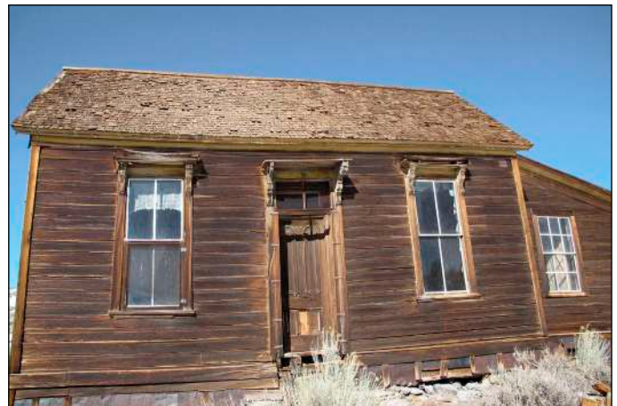
The Kirkwood house (above and below) will benefit from roof repairs, siding re-attachment, and interior stabilization and repairs. Foundation members can take pride in the restoration work that will benefit all of Bodie's visitors.