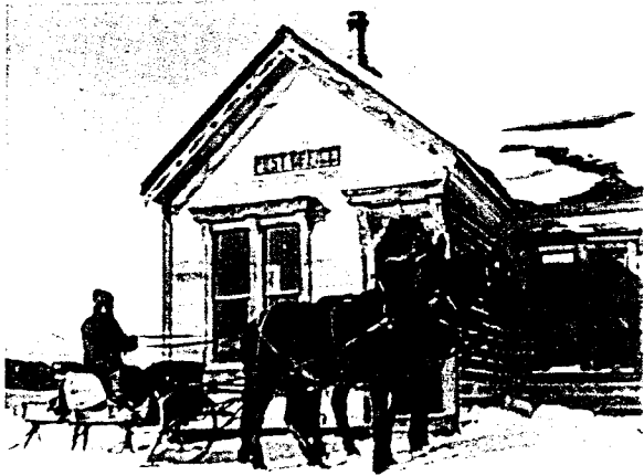
Post Office in 1937 at Bodie with postmans snow sled. Can you guess which building this is today?