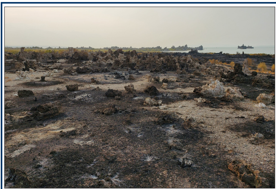
The "Beach Fire" was ignited by a lightning strike August 16 near Navy Beach.