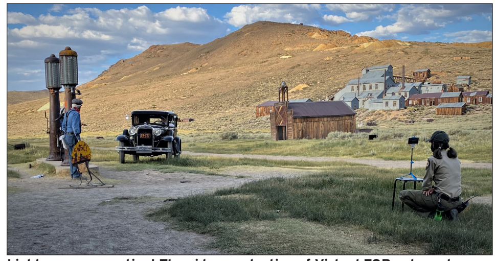
Lights, camera, action! The video production of Virtual FOB gets underway in early August. See more photos, pages 8-9.

Despite these setbacks, the small Bodie Foundation staff stayed fully employed this year. The Bodie Foundation worked with California State Parks staff to meet all Covid-19