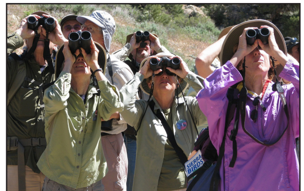
Birders flocked to the 14th annual Mono Basin Bird Chautauqua June 19-21, 2015.

Mindful Birding is a charitable project of the Morrissey Family Foundation that presents ethical birding guidelines from around the world, and offers awards to birding festivals that demonstrate improved or superior ethics.