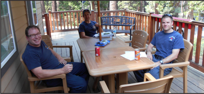
Firefighters relax on the Visitor Center deck at Grover Hot Springs State Park.