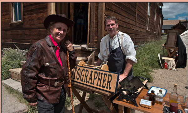
A few of the sights and sounds of Friends of Bodie Day 2015.