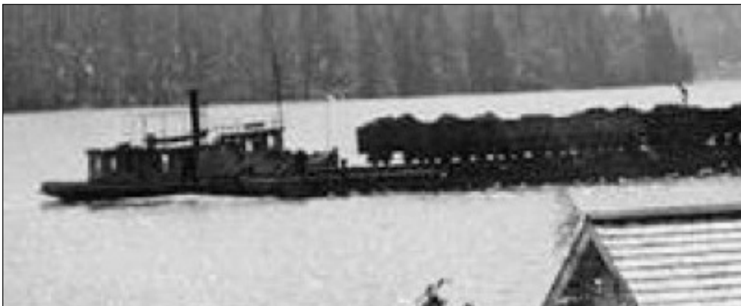
Although this is not the Rocket nor Mono Lake, this photo nonetheless gives you an idea of what the Rocket towing a barge (use your imagination here – the barge is stacked with railroad ties – wink wink) may have looked like.