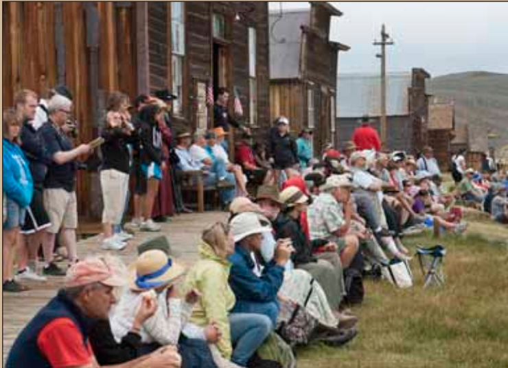
Spectators gather along the Main Street boardwalk in front of the Museum to listen to guest speakers.