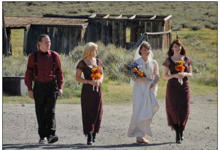
The bride and members of her wedding party cross Bodie’s Green Street on the way to the Methodist Church.

groom, along with a handful of modern Bodieites, staggered back to their historical housing too tired for the traditional wedding shivaree.