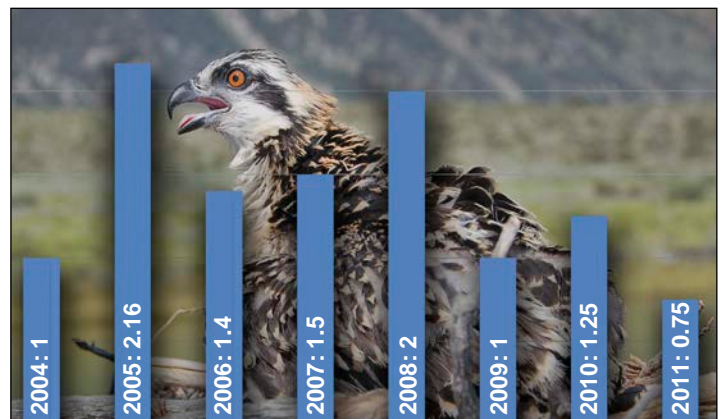
Chart showing average osprey young fledged per active nest at Mono Lake Tufa SNR from 2004-2011 (year:young fledged).

funded entirely through private donations and grants.