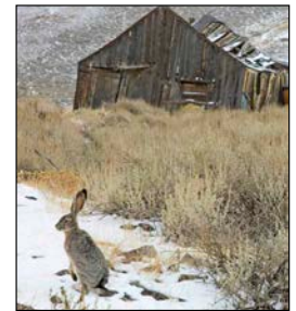
Bodie is open year round, but the road closes to vehicles because of snow in the winter. Winter hours are 9 a.m. - 3 p.m. or as posted.