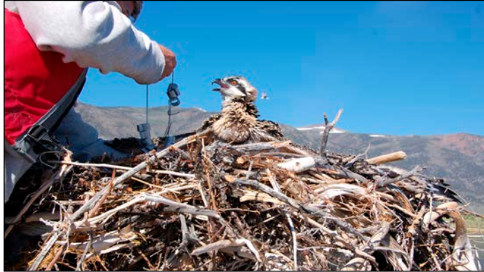
A young osprey gets banded in its nest. Near record snowfalls and the late arrival of summer temperatures resulted in a slightly lower than normal Osprey survival rate at Mono Lake.

The nesting success this year was the lowest documented during this study, at 0.75 young fledged per active nest. There were four nests that fledged a single young, one nest fledged 2