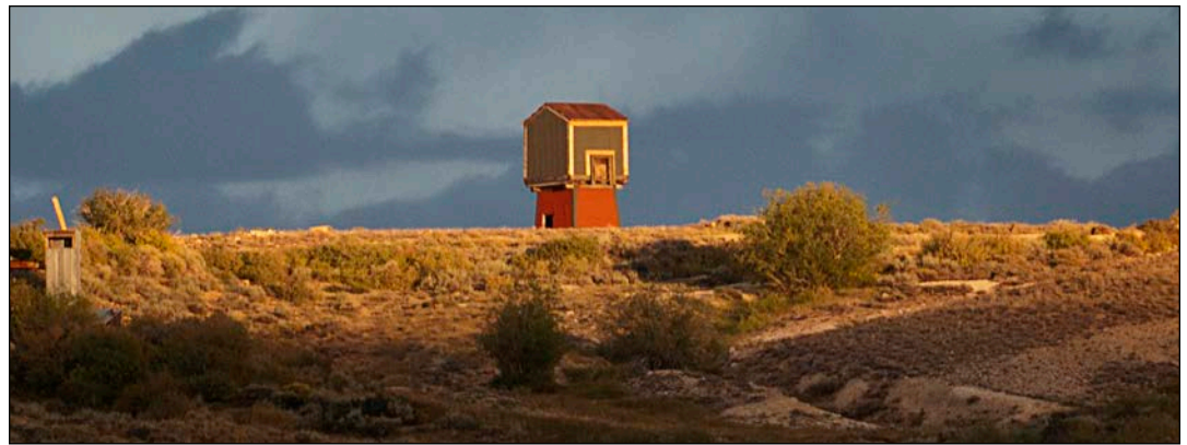
The Bodie Railway water tower, toppled after a high wind storm, was rebuilt and restored (top photos). The tower is again a dominant feature on the ridgeline above town (bottom photo).